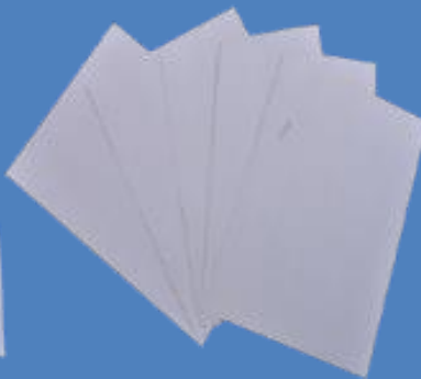
Product Bottom View