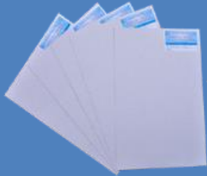
Product Top View