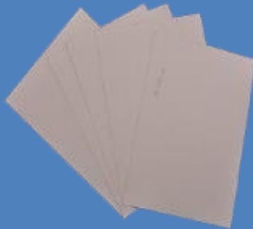
Product Bottom View