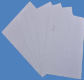
Product Bottom view