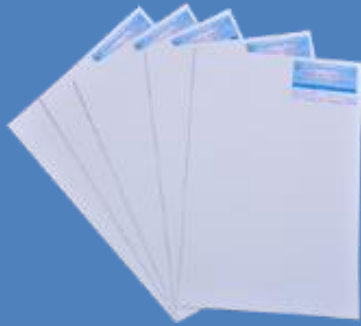
Product Top view