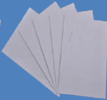
Product Bottom View