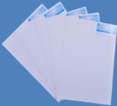
Product Top View