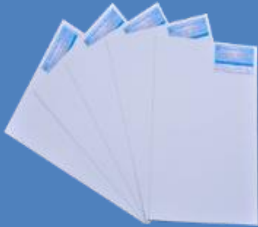
Product Top View